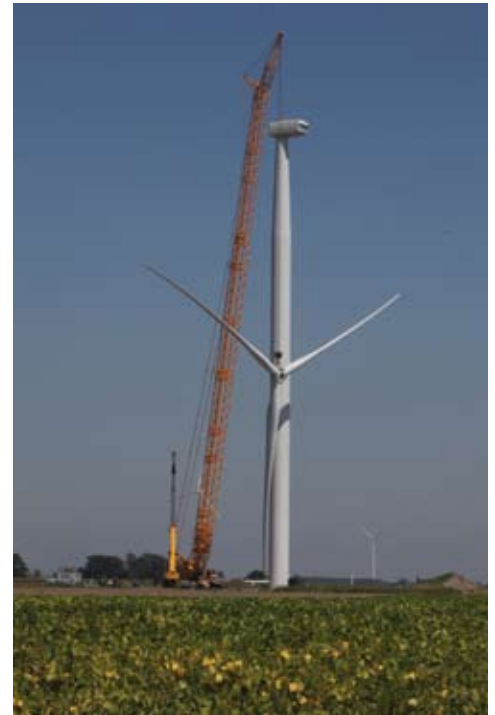
Erecting the blades at Gratiot County Wind Farm

Aristeo is the General Contractor working with the project developer, Invenergy LLC. This Balance of Plant (BOP) contract includes road construction, foundation placement, turbine erection, site restoration, and road repairs. The project site is spread over 88 square miles – the largest wind farm site Aristeo has worked on to date. With such a large project area, each turbine site requires extensive planning and coordination.