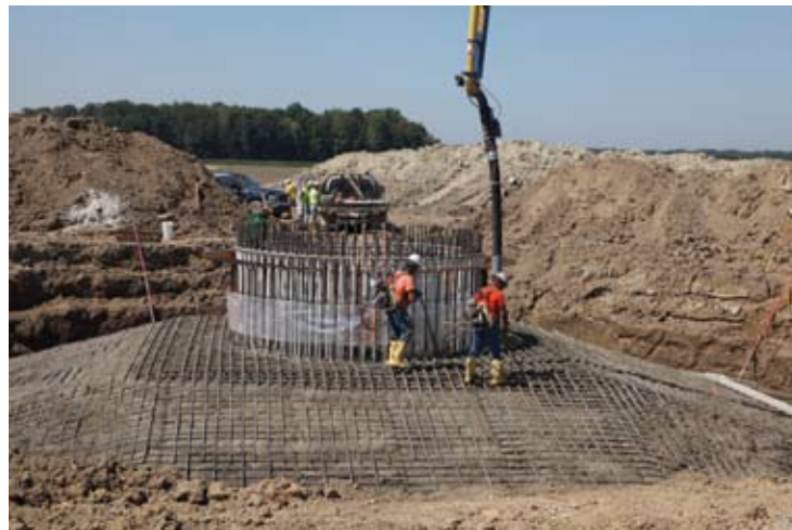
Pouring base foundations

The Gratiot County Wind Farm is scheduled to take 13 months to complete with a majority of the turbine erection taking place during the coming fall and winter months.